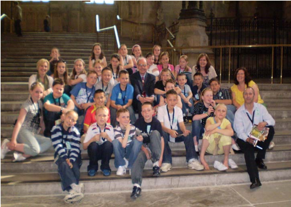
London visit – Children with our local MP Chris Mullin

The school trip to London was a great success everyone had a fabulous time. The children conducted themselves well and were a real credit to their parents and school. We would like to invite parents and children to see a display of photos and work on Tuesday 8 th July 2008 at 4.30pm.