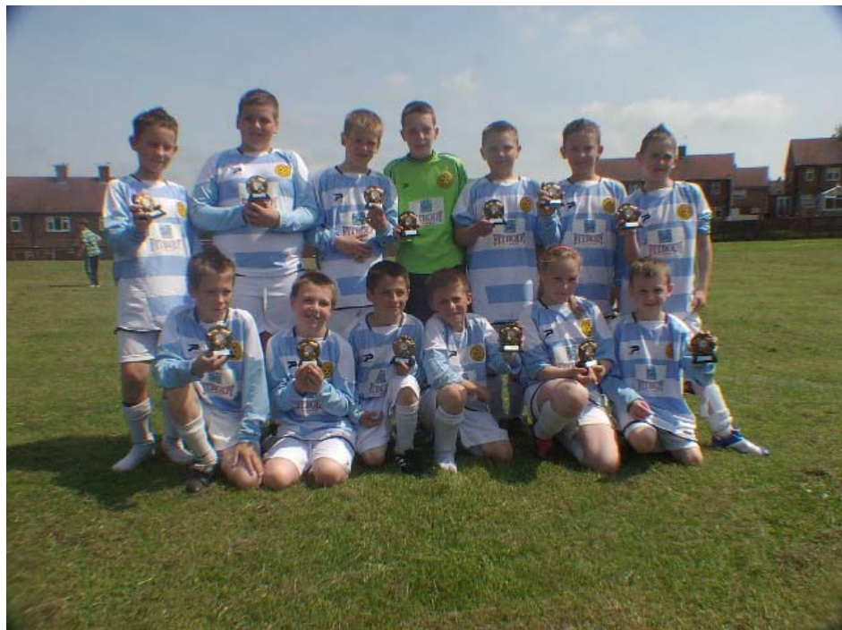
Year 6 Football team