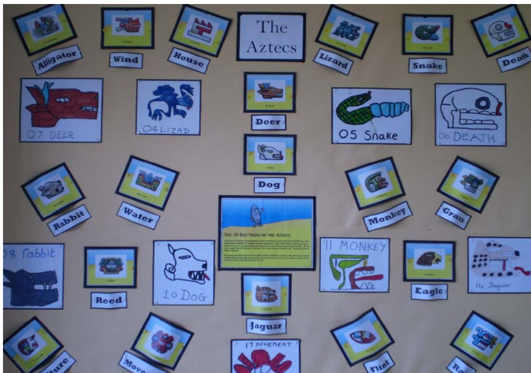
Year 3 display on The Aztecs