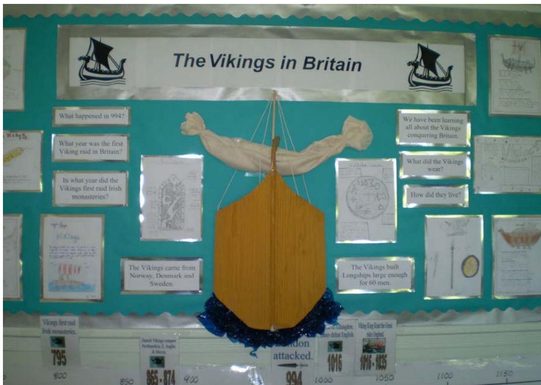
Year 4 display on The Vikings in Britain